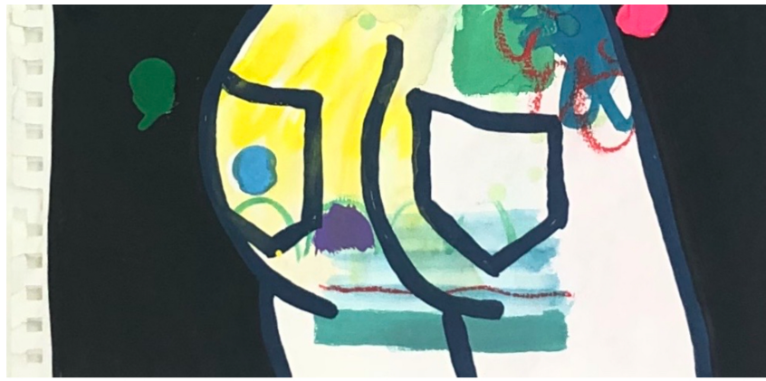
Héctor Madera, Pablito y su culito , 2020, mixed media on paper, 14 x 11 in

Their Collectors Circle already has around 1,000 art lovers, with members belonging to more than 25 different countries. Sales exceed 80% of the featured works with pieces that vary in technique and theme: from the expressionist abstraction of Leticia Sampedro to the monochromatic hyperrealism of the Icelandic Karen Pálsdóttir. The watercolour-feel of the oil paintings by British artist Ben Walker; the fluidity of the brush of the Argentinian Paz Bardi; or the photographic series by Colombian Laura Jiménez Galvis; are other examples of artists featured to date. They also invite friend curators like María Gracia de Pedro, who brought Spanish artist Fernando Martín Godoy; Izam Zawarha, who presented acclaimed artist Héctor Madera; or Pepe Baena, introducing Barbadian artist and activist Annalee Davis. This last week of November, La Pera Projects featured their first group presentation as a homage to the Miami Art Week, which this year was cancelled. The all-female presentation included Latin American and Spanish artists María Isabel Arango, Gala Knörr, Alice Quaresma, and Alex Valls.