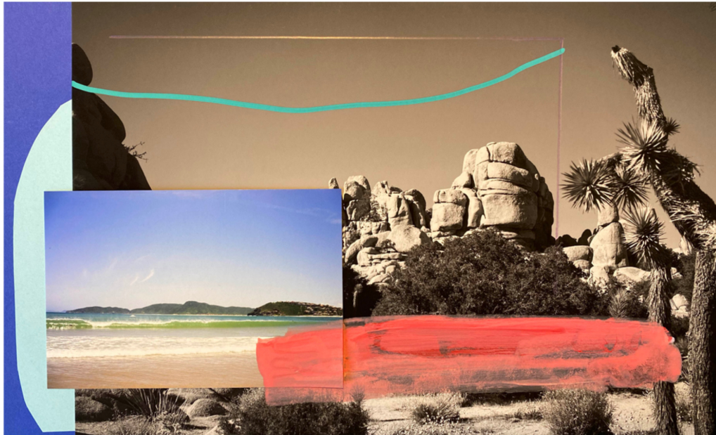
Featured image : Alice Quaresma. Earthquake #8 , 2020, acrylic paint, color pencil and paper over photo collage, 7.5 x 12 in.

The mobile art collecting platform for digital natives, a blog post by .ART adopter La Pera Projects