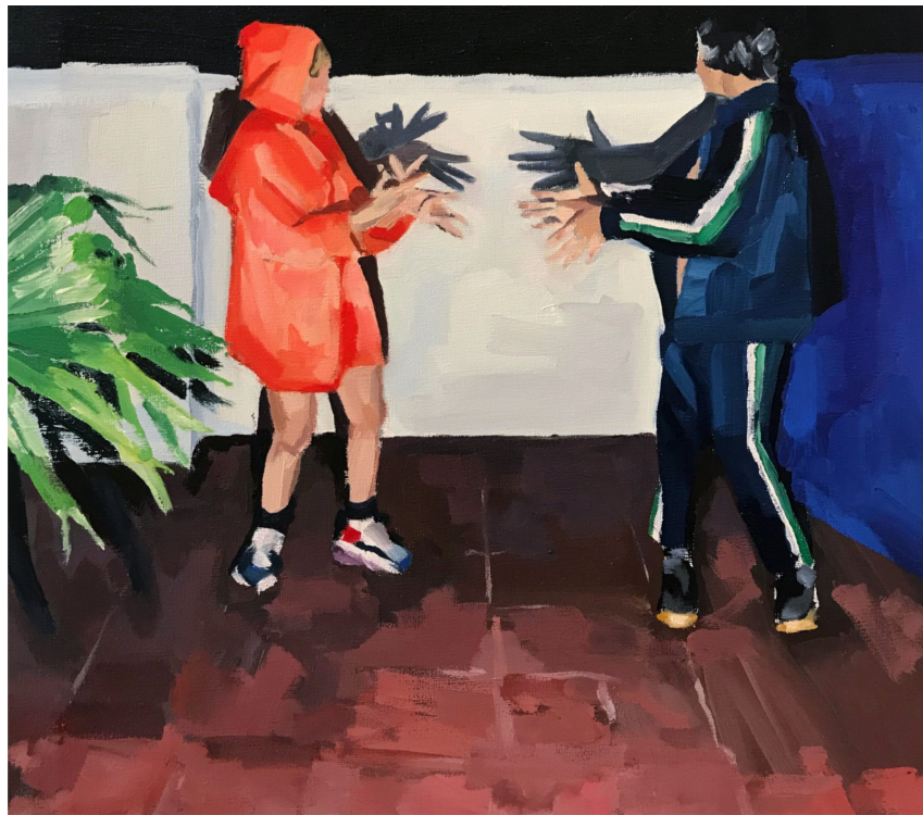
Paz Bardi, S_T , 2019, oil on canvas, 11.8 x 15.7 in

This is the case of the founders of La Pera Projects: a duo of entrepreneurs who want to end the stereotypes associated with art collecting by relying on WhatsApp as the main communication channel. The project, that began to take shape before the pandemic, was born with the aim of changing some preconceived ideas: that contemporary art is an unattainable luxury asset reserved for only a few, and that everything that surrounds contemporary art is exclusive and only understood by the economic and intellectual elites.